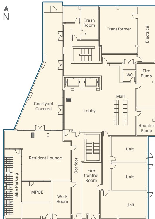
Level 1 Building Area 9,426 sf