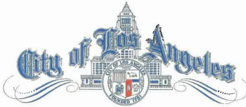
KAREN BASS MAYOR