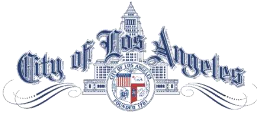
KAREN BASS MAYOR