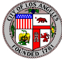
ERIC GARCETTI MAYOR