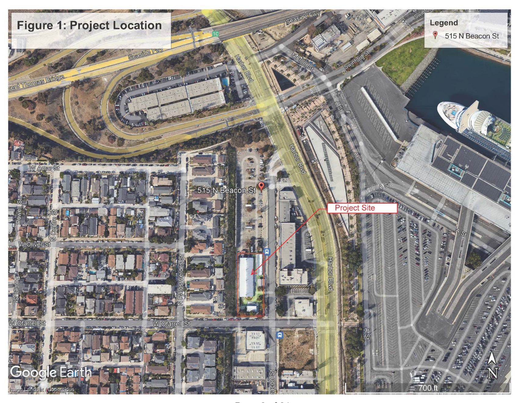
Page 2 of 21