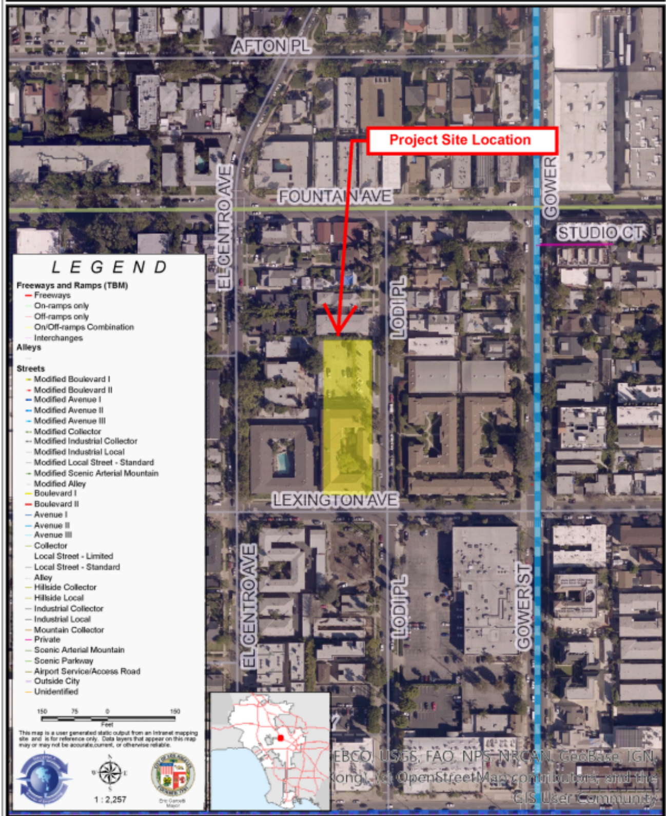
Figure 1: Project Site Location