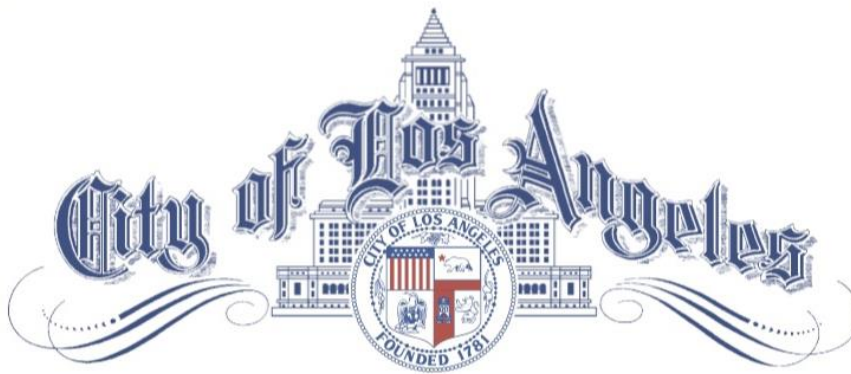
ERIC GARCETTI MAYOR