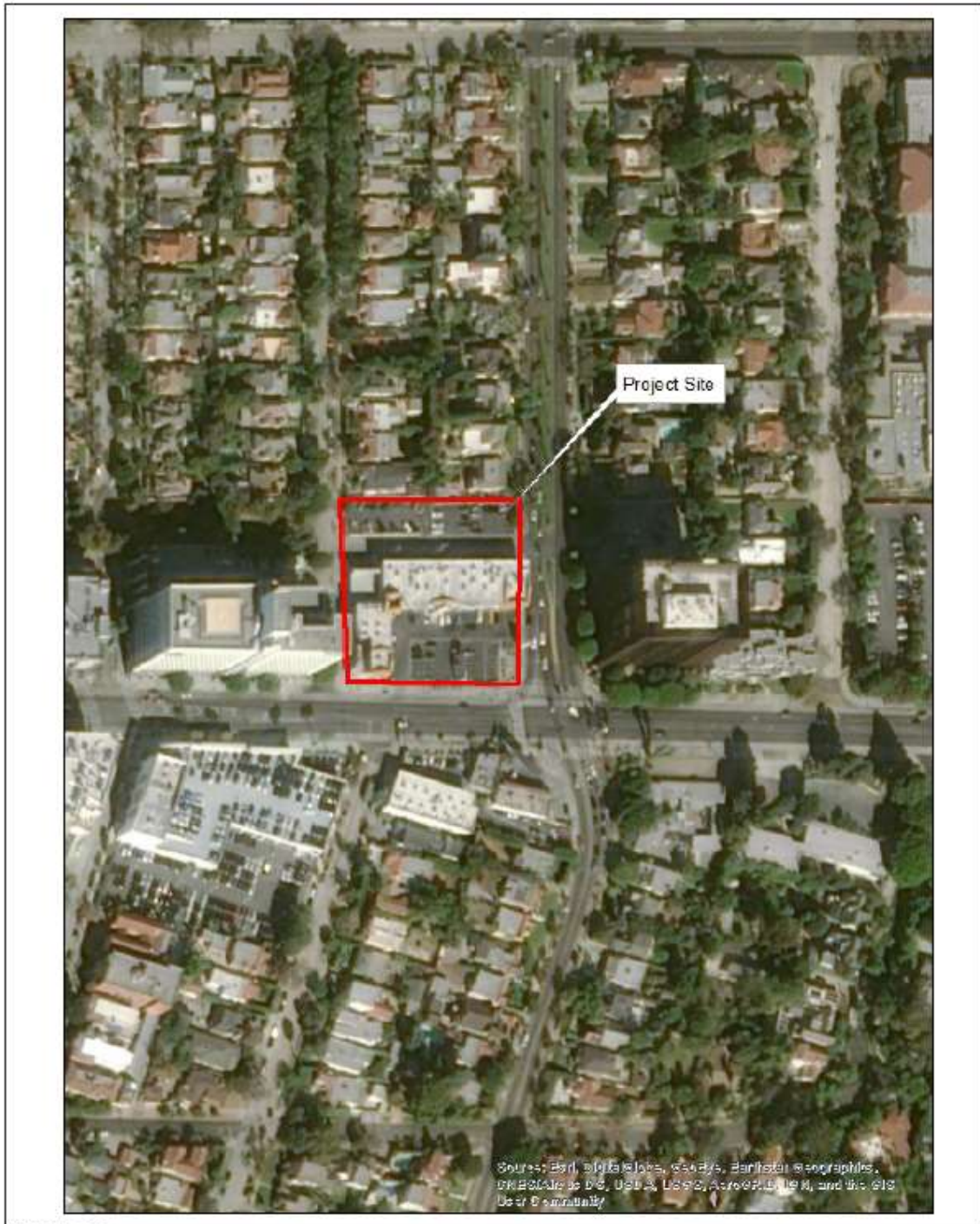
Figure 1 – Proposed Project Site