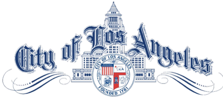
KAREN BASS MAYOR