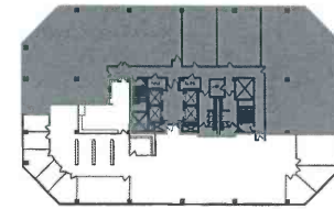
FLOOR LOCATION PLAN