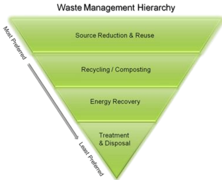
Figure 2. USEPA Waste Management Hierarchy

environmentally preferred method of managing waste 1 (Figure 2). Therefore, there are no unusual circumstances that would lead to a significant impact due to the ordinance.