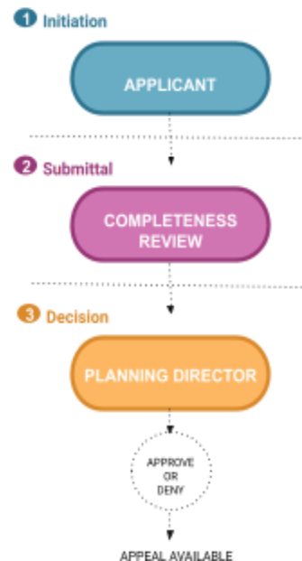
Sec. 13B.12.3. Redevelopment Plan Project Compliance