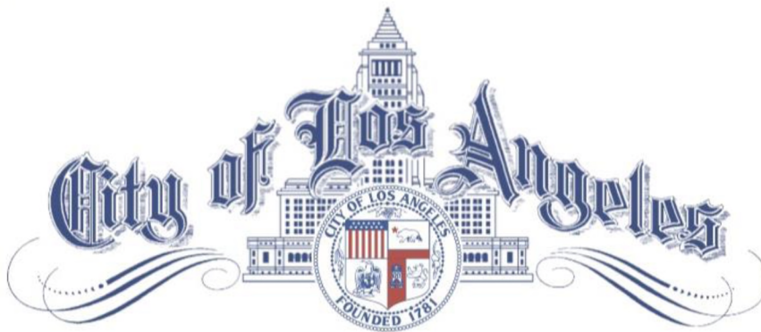
ERIC GARCETTI MAYOR