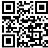
QR Code to Online Appeal Filing

Verification of condition compliance with building plans and/or building permit applications are done at the City Planning Metro or Valley DSC locations. An in-person or virtual appointment for Condition Clearance can be made through the City's BuildLA portal ( appointments.lacity.org ). The applicant is further advised to notify any consultant representing you of this requirement as well.