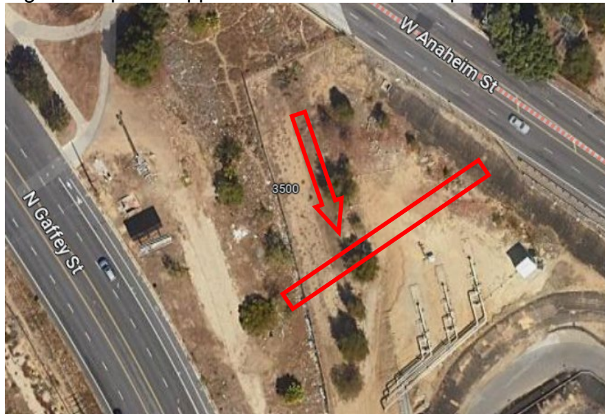
Figure: Map and Approximate Location of Proposed Easement

Location – A segment of this Project is on a portion of P66's property near North Gaffey Street and West Anaheim Street in San Pedro. Approval of the Agreement will allow LADWP to use approximately 937 square feet along an embankment in P66's property for a segment of the recycled water pipeline. Figure 1 below is an approximate depiction of the location of the proposed easement.