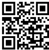
QR Code to Online Appeal Filing

Verification of condition compliance with building plans and/or building permit applications are done at the City Planning Metro or Valley DSC locations. An in-person or virtual appointment for Condition Clearance can be made through the City's BuildLA portal ( appointments.lacity.org ). The applicant is further advised to notify any consultant representing you of this requirement as well.