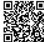
QR Code to BuildLA Appointment Portal for Condition Clearance