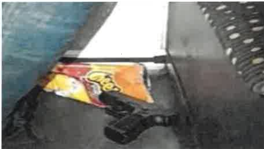
Figure No. 1 – Replica Handgun Recovered at Scene (Division of Records No. 2306-17539)