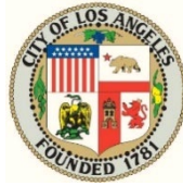
KAREN BASS MAYOR