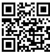
QR Code to Online Appeal Filing

An appeal application must be submitted and paid for before 4:30 PM (PST) on the final day to appeal the determination. Should the final day fall on a weekend or legal City holiday, the time for filing an appeal shall be extended to 4:30 PM (PST) on the next succeeding working day. Appeals should be filed early to ensure that DSC staff members have adequate time to review and accept the documents, and to allow appellants time to submit payment.