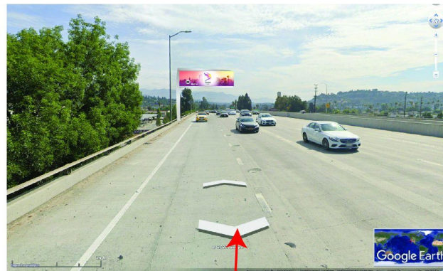
Billboard Back: view to ? (this side dangerous and not needed) Projects to neighborhood vs drivers Distracted driving - view from rear view mirror

FF-13 SR-2 South Lanes NE of Casitas Avenue (parcel no. 5436033906) Two-sided 672 square feet of display area - display size 14' tall x 48' wide x 85' high (Sign height from grade)