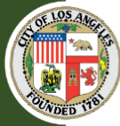
EXHIBIT E 2 nd ADDENDUM