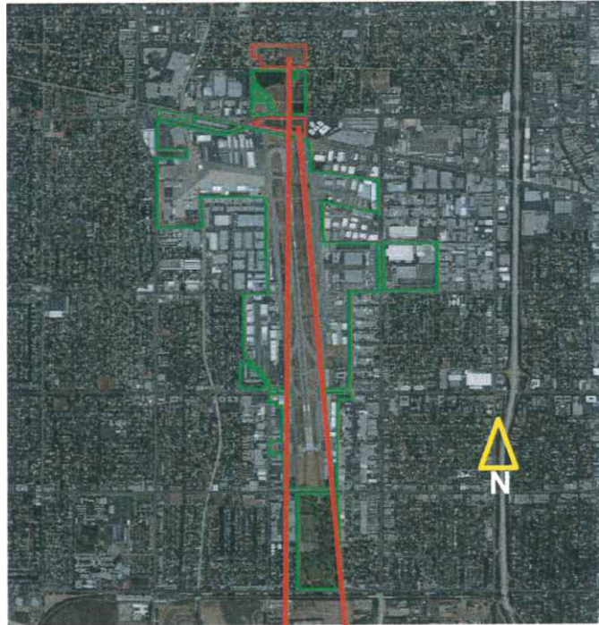
Location Map – 16405 Chase Street

Exhibit 1: Valley Sod Farms Inc. – First Amendment