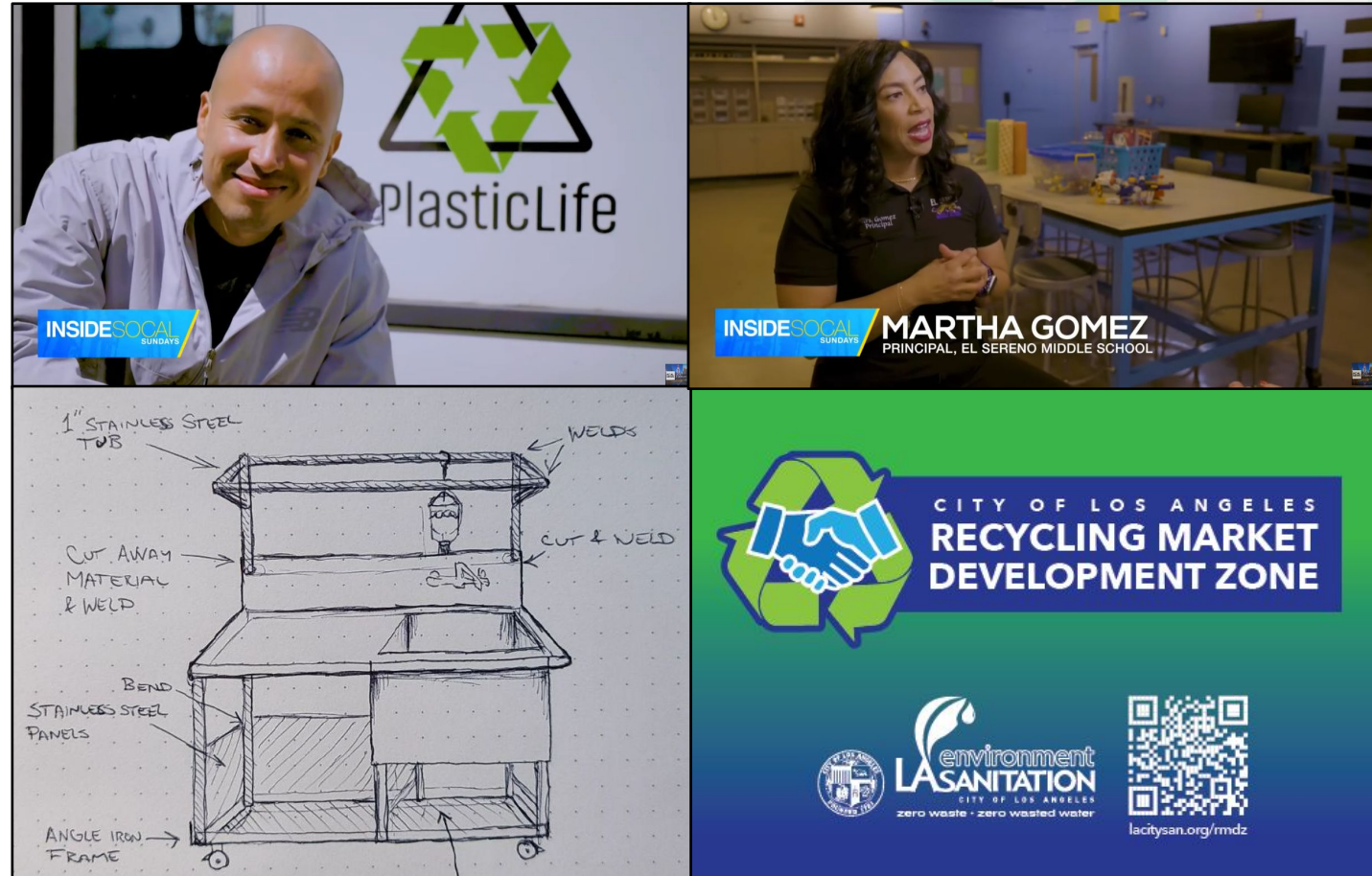
Photos (above): (top) 1PlasticLife interview with KCAL News on their plastic pollution project at El Sereno Middle School; (bottom-left) Circular Fashion LA's Mobile ReDye Station sketch; (bottom-right) LASAN's special RMDZ window cling to promote the Microfunding Initiative projects.

LA businesses need avenues to test new innovative approaches to create recycled products and establish the City of LA as a leader of green innovation.