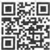
QR Code to Online Appeal Filing

Verification of condition compliance with building plans and/or building permit applications are done at the City Planning Metro or Valley DSC locations. An in-person or virtual appointment for Condition Clearance can be made through the City's BuildLA portal ( appointments.lacity.org ). The applicant is further advised to notify any consultant representing you of this requirement as well.