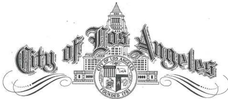
ERIC GARCETTI MAYOR